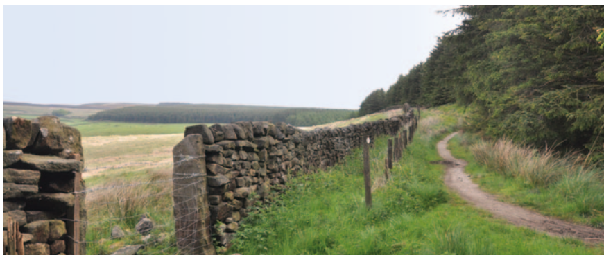
Photo: Gateway in Rivock Edge Forest where the Dew Stones are now installed.

You can approach the same junction from the B6265. At the traffic lights at East Riddlesden Hall, turn right, from Bingley, or left from Keighley, up Granby Lane. Take the second left onto Banks Lane. Follow for 1 mile up the hill to the T-junction with Silsden Road.